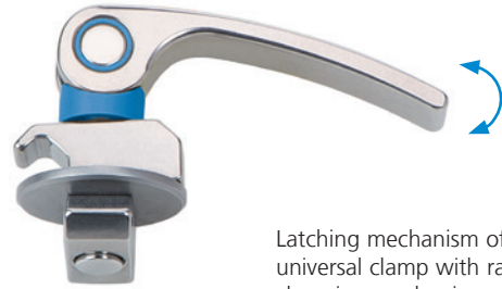
Latching mechanism of the universal clamp with rapid clamping mechanism

Dovetailing provides double protection against movement