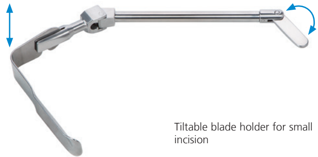
Tiltable blade holder for small incision